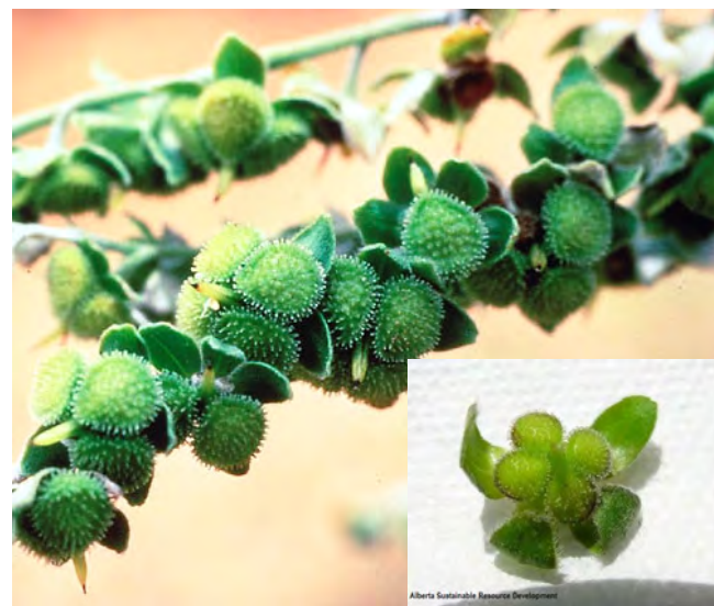
www.invasiveplants.ab.ca/ Alberta Sustainable Resource Development