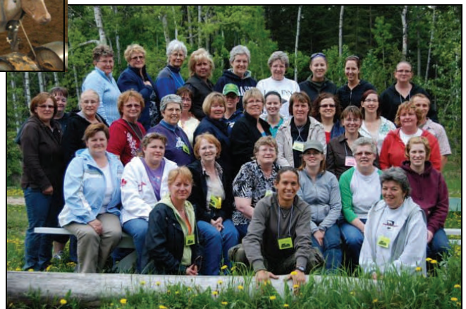
Grazing School for Women 2009 in Smoky Lake

"Life on the farm is a school of patience; you can't hurry the crops along or grow a prize bull in two days!"