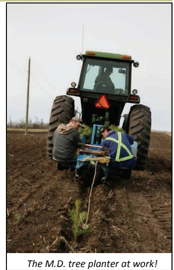
The M.D. tree planter at work!

zone, you only want to plant a couple trees). Consider planting with a shovel; dig out a basin 3 foot wide for seedlings, which helps to hold water for the tree. Consider using a chemical such as glyphosate to control grass & weeds—remember that any competition is detrimental to tree success. (some people like grass planted under their spruce and pine; and wonder why the tree looks to be struggling; its either the grass is giving too much competition or the tree is being exposed to too many whipsniper nicks!) If the grass is still green under your little trees, now is a great time to spray since the tree's needles have a hard, waxy coating protecting