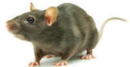
Adult rat is 7-10 inches long and 1 lb,

Fever, Leptospirosis all can be transmitted to humans. Rats eat 10% of their body weight, which is about 10-20lbs per year, however they contaminate 10 times the amount of grain that they eat (200 lbs. per year!)