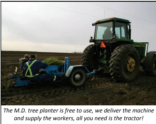
The M.D. tree planter is free to use, we deliver the machine and supply the workers, all you need is the tractor!

them. Important Note—in the spring, coniferous trees come out of dormancy and have a very sensitive growing tip, called a "candle", this candle is highly susceptible to chemical applications.