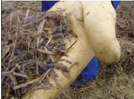
Rat excrement is about 3/4" long.

been a more relaxed attitude toward rats, since they are more main stream popular. People keep rats for food for other pets (like snakes), plus even keep rats as a pet, as rats are very smart!