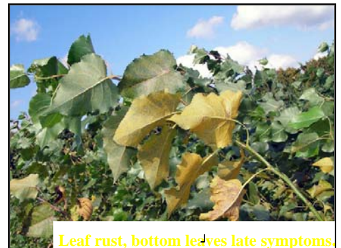
Leaf rust, bottom leaves late symptoms.

Once the rust is established on aspen hosts, it can multiply rapidly under favourable wet conditions throughout the summer. Several years of heavy infections can cause some growth losses, especially on younger trees. Fallen infected leaves shelter the fungus until the next year's disease cycle.