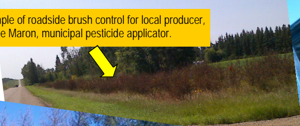
Excellent example of roadside brush control for local producer, by Laine Maron, municipal pesticide applicator.