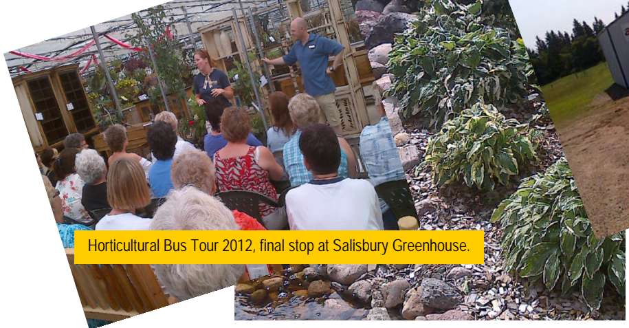
Horticultural Bus Tour 2012, final stop at Salisbury Greenhouse.