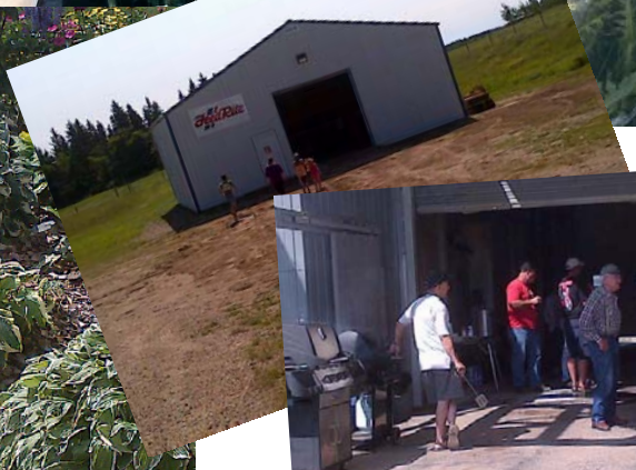
Edgerton Seed Plant Open House and BBQ!