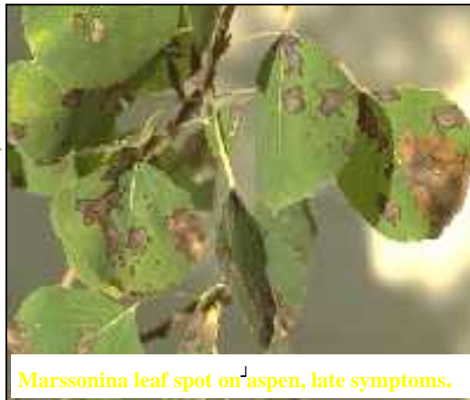
Marssonina leaf spot on aspen, late symptoms.

Once the rust is established on aspen hosts, it can multiply rapidly under favourable wet conditions throughout the summer. Several years of heavy infections can cause some growth losses, especially on younger trees. Fallen infected leaves shelter the fungus until the next year's disease cycle.