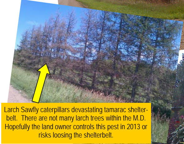
Larch Sawfly caterpillars devastating tamarac shelterbelt. There are not many larch trees within the M.D. Hopefully the land owner controls this pest in 2013 or risks losing the shelterbelt.