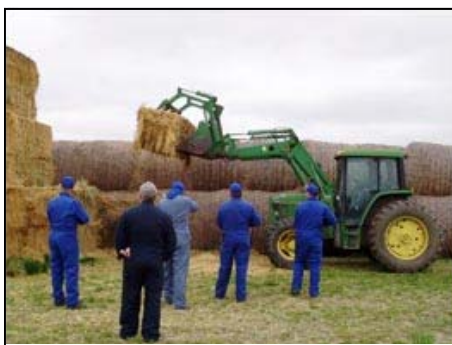
Alberta Rat Patrol team, on farm clean-up.

Over the last few years however, rat harbouring has been increasing. The influx of new Albertans unaware of our prized Provincial victory, a generation of younger Albertans oblivious to the devastation rats can cause, the increasing number of "fancy rats" as pets or used as pet food, and the amount of materials and goods that are transported across provincial borders through