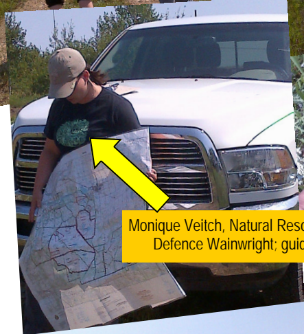
Monique Veitch, Natural Resource Tech at CFB/ ASU National Defence Wainwright: guiding Spotted Knapweed Tour.