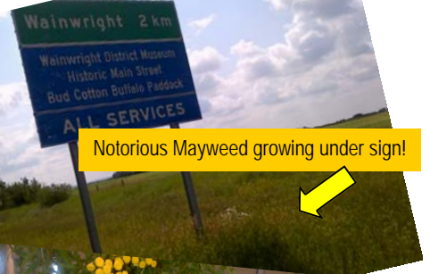
Notorious Mayweed growing under sign!