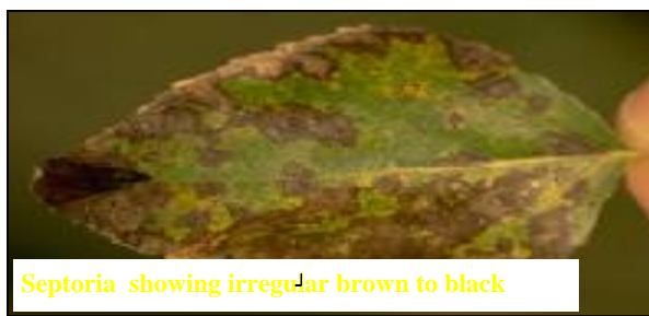
Septoria showing irregular brown to black

considerably between tree species and with time. Symptoms include a distinct tan circular spot with black margins and small black pimples in the center, and irregular brown to black spots that coalesce into large areas.