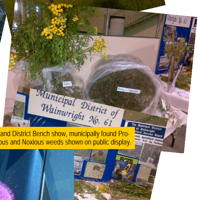
Wainwright and District Bench show, municipally found Prohibited Noxious and Noxious weeds shown on public display.