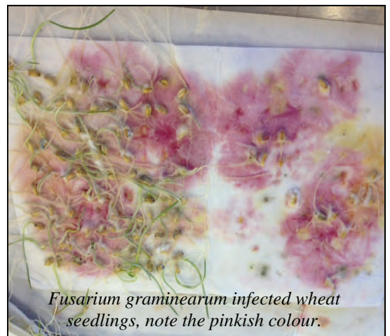
Fusarium graminearum infected wheat seedlings, note the pinkish colour.

Farmers can easily pre-treat their seed themselves; or they can get it done at their seed plant. The benefits of protection far away the minimal cost or inconvenience, especially since pre-treating also helps with other seedling pre-